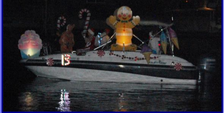
2 nd Place: Candyland (#13)