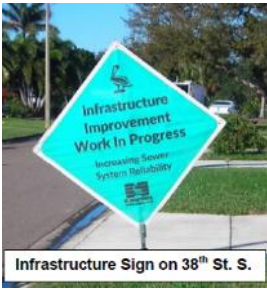
Infrastructure Sign on 38 th St. S.