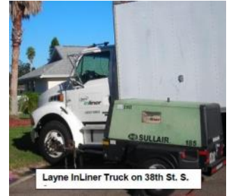
Layne Inliner Truck on 38th St. S.

Over the past year, some $70 million dollars in repairs and resiliency-building work has taken place in our city's sewage system with more than $250 million already earmarked for future water and sewer projects over the next three years. In Broadwater, the west end of 42 nd Ave. S has benefited from some of these repairs which included the addition of two new major storm drains. Consequently, there was no sighting of any sanitary overflows or flooding in 2017 similar to the past event at 42 nd Ave. S at 41 st St. S in 2016. However there were two major floods in 2017 at the 42nd Ave. at 37 th St. S intersection. Recently, Carlos Frey, Public Works Design Engineering Manager, updated progress on the engineering study of this intersection. At this time, the project design calls for the separation of the 34th Street stormwater runoff from the 37th Street runoff allowing two independent operating systems resulting in estimated construction costs currently at $2.0 million and will require budgeting for full implementation. Also, according to