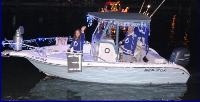
3 rd Place: Merry Pucking Christmas Go Bolts (#3)